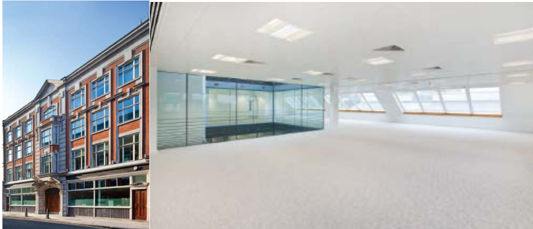
Photo shows earlier refurbishment/carpet