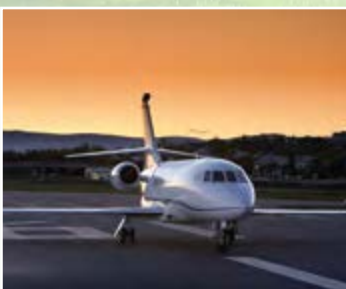
Northolt Private Airport 28 mins & 13.5 miles to Berkeley Square 10 mins & 3 miles to The Lord Mayors Palace