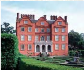
Kew Palace 27 mins & 9 miles to Berkeley Square 28 mins & 14 miles to The Lord Mayors Palace