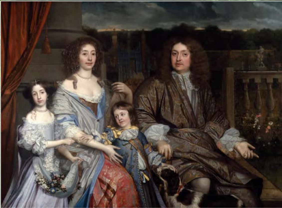
Sir Robert Vyner and his family