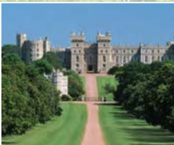
Windsor Castle 42 mins & 22 miles to Berkeley Square 24 mins & 15 miles to The Lord Mayors Palace