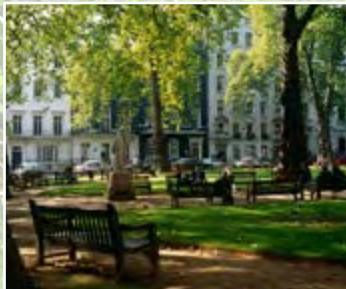
Berkeley Square, Mayfair 29 mins & 15 miles to The Lord Mayors Palace