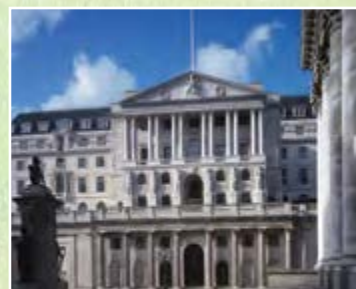
Bank of England 15 mins & 3 miles to Berkeley Square 39 mins & 18 miles to The Lord Mayors Palace