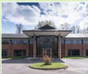
Harrington House 29 mins & 15 miles to Berkeley Square