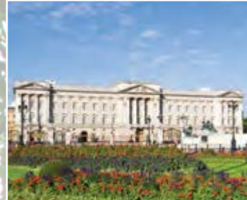
Buckingham Palace 6 mins & 1.5 miles to Berkeley Square 31 mins & 16 miles to The Lord Mayors Palace