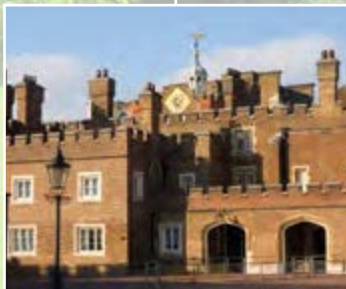
St James's Palace 4 mins & 1 mile to Berkeley Square 32 mins & 16 miles to The Lord Mayors Palace