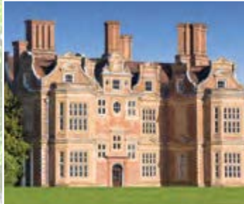
The Lord Mayors Palace 29 mins & 15 miles to Berkeley Square