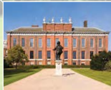
Kensington Palace 9 mins & 2.5 miles to Berkeley Square 26 mins & 14 miles to The Lord Mayors Palace