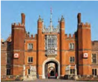
Hampton Court Palace 42 mins & 14 miles to Berkeley Square 37 mins & 21 miles to The Lord Mayors Palace