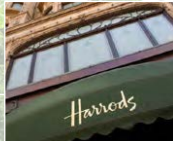
Harrods 7 mins & 1.5 miles to Berkeley Square 30 mins & 15 miles to The Lord Mayors Palace